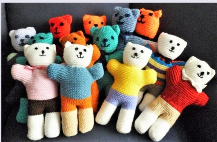
Some colourful 'Trauma teddies' knitted by members