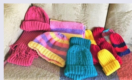
Some knitting by Ethel