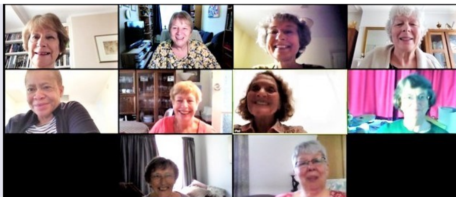
One of our Zoom meetings

However, members have been busy knitting, baking, crafting and sowing seeds that were given out in February. We are looking forward to and waiting for better times.