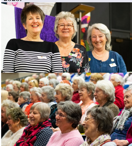
Memories of the 2019 ACM in Ruislip.

Covid-19 has given us many challenges over the past few months and holding a legally required meeting is just one of them. Anyone not able to attend will be able to get information from their WI Secretary as Standing Orders, Minutes of the previous meeting, Financial accounts were sent to Secretaries back in March 2020.