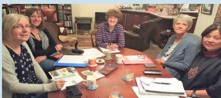
Remembering in-person Committee meetings

Members elect a new Committee each year at their Annual Meeting. It should include at least three Committee