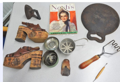
Above, Greenfield's 'Blast from the Past' items, and below, the mystery tool: can you identify it for them?

It is a small tool with a wooden grip in centre and what looks like stainless steel awls at each end (see picture). We think it may be an awl for leatherwork, or a modeller's tool. If any of our readers has a similar one or can definitely identify it we would be so grateful to know what it is: let us know!