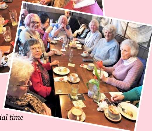
Members enjoying a social time with coffee and cake.